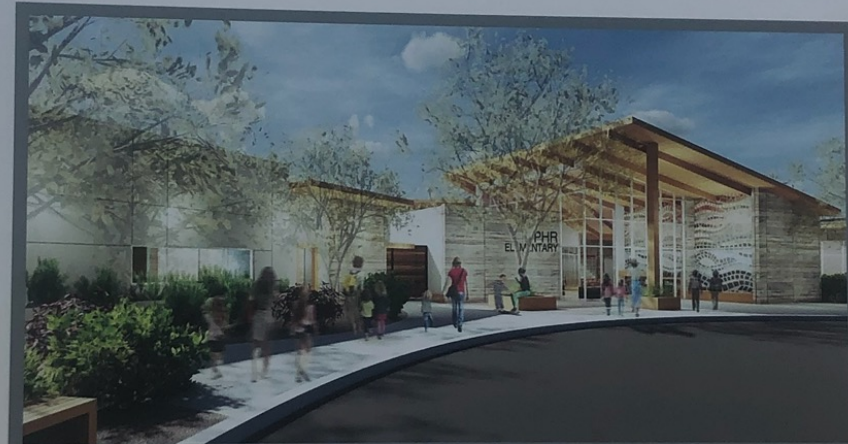
PACIFIC HIGHLANDS RANCH #9